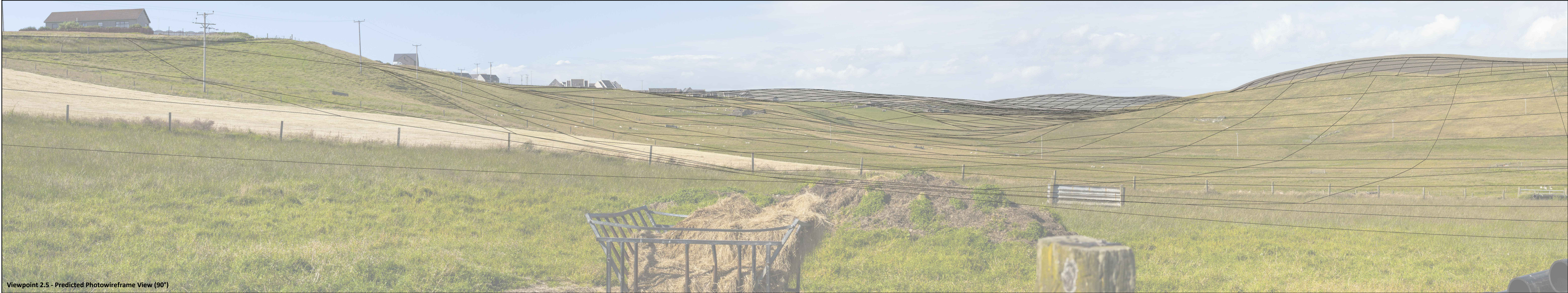
Viewpoint 2.5 - Predicted Photowireframe View (90°)

Viewpoint 2.5 Information: Minor Road, Norwick Grid Reference: 464933, 1214028 Bearing to Site: 230° Distance to Site: 1.1km Camera Make: Canon EOS 5D Mk II Camera Lens: 50mm Date: 27/07/2020 Time: 10:38