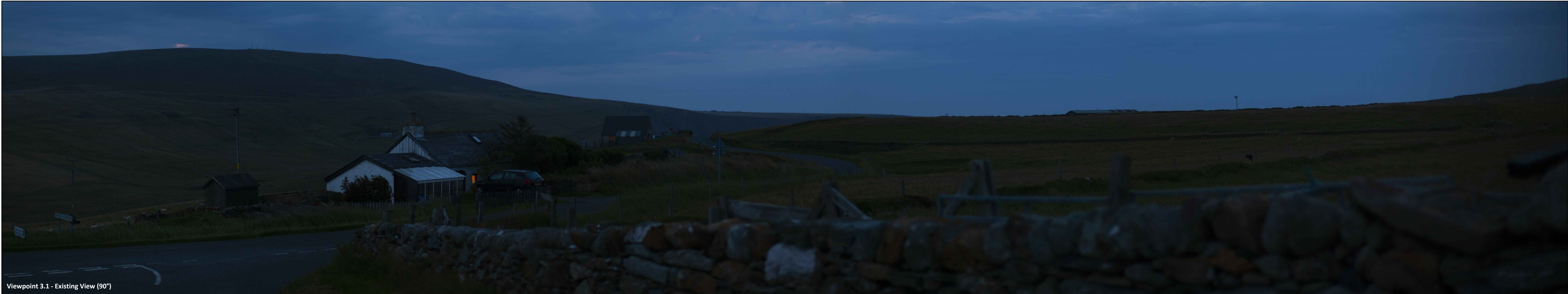
Viewpoint 3.1 - Existing View (90°)