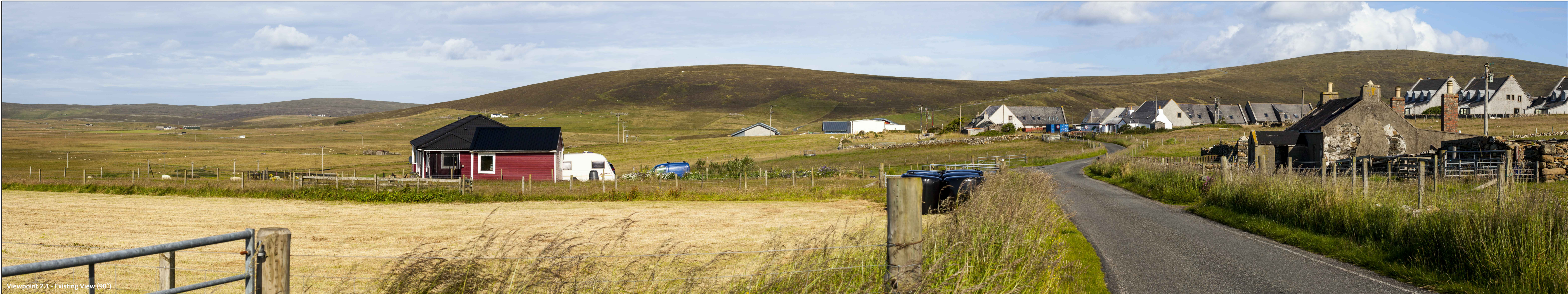
Viewpoint 2.1 - Existing View (90°)