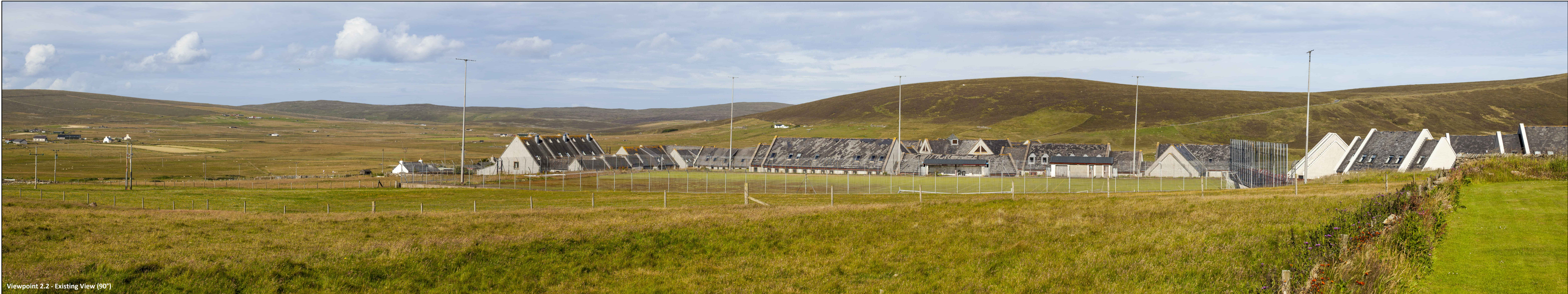
Viewpoint 2.2 - Existing View (90°)