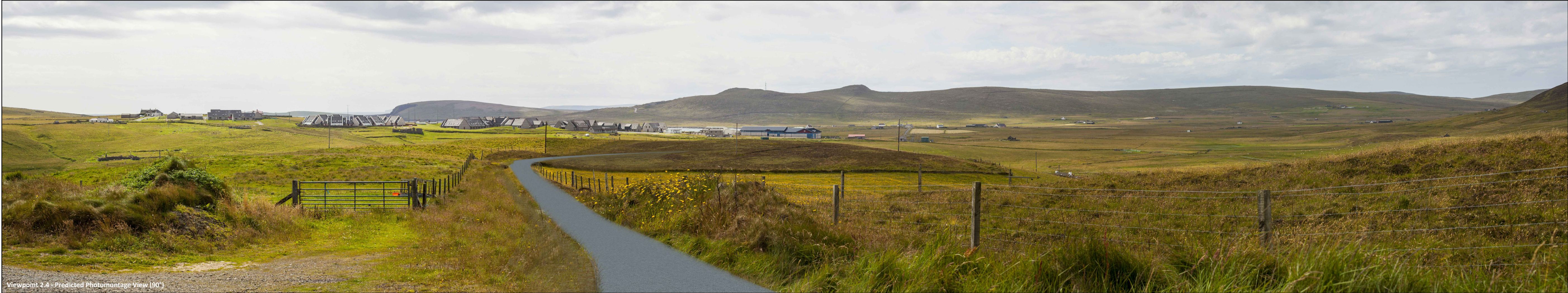
Viewpoint 2.4 - Predicted Photomontage View (90°)

Viewpoint 2.4 Information: Minor road at Houlanbrindy Grid Reference: 464328, 1214266 Bearing to Site: 195° Distance to Site: 1.0km Camera Make: Canon EOS 5D Mk II Camera Lens: 50mm Date: 27/07/2020 Time: 12:23