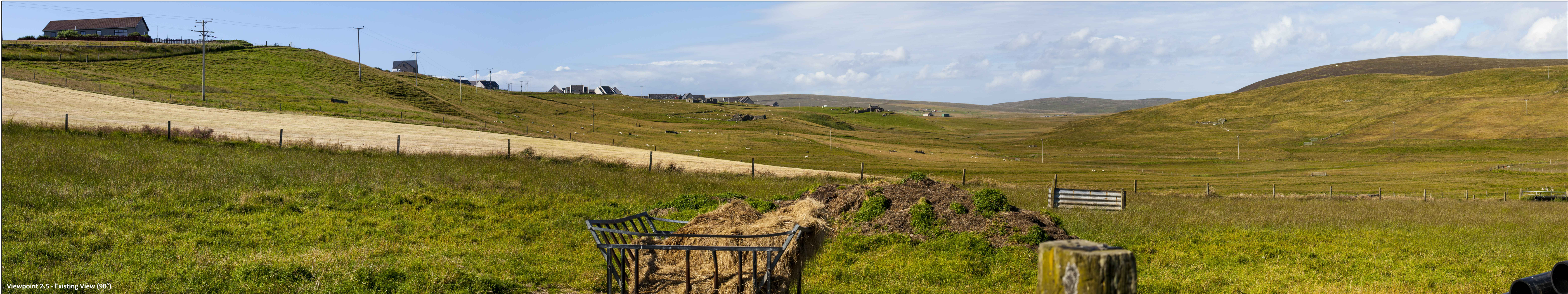
Viewpoint 2.5 - Existing View (90°)