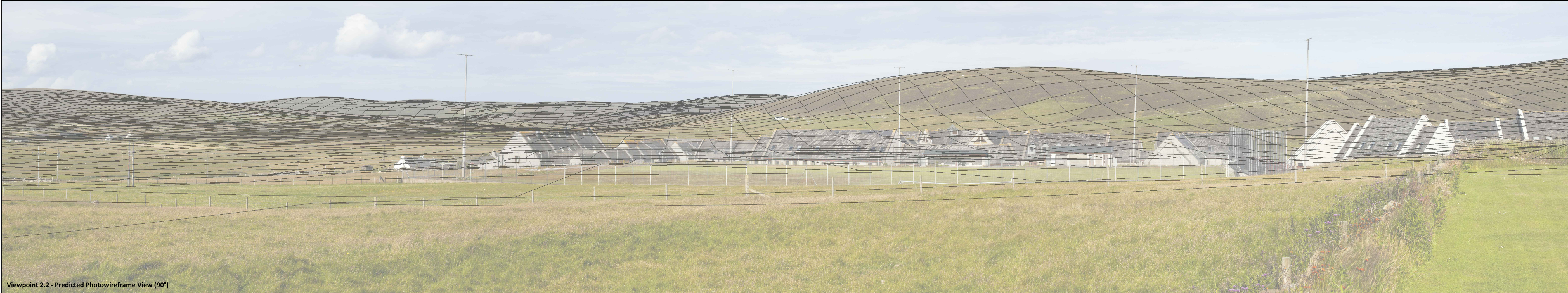
Viewpoint 2.2 - Predicted Photowireframe View (90°)

Viewpoint 2.2 Information: Methodist Church, Valsgarth / Saxa Vord Grid Reference: 464589, 1213315 Bearing to Site: 275° Distance to Site: 520m Camera Make: Canon EOS 5D Mk II Camera Lens: 50mm Date: 27/07/2020 Time: 10:10