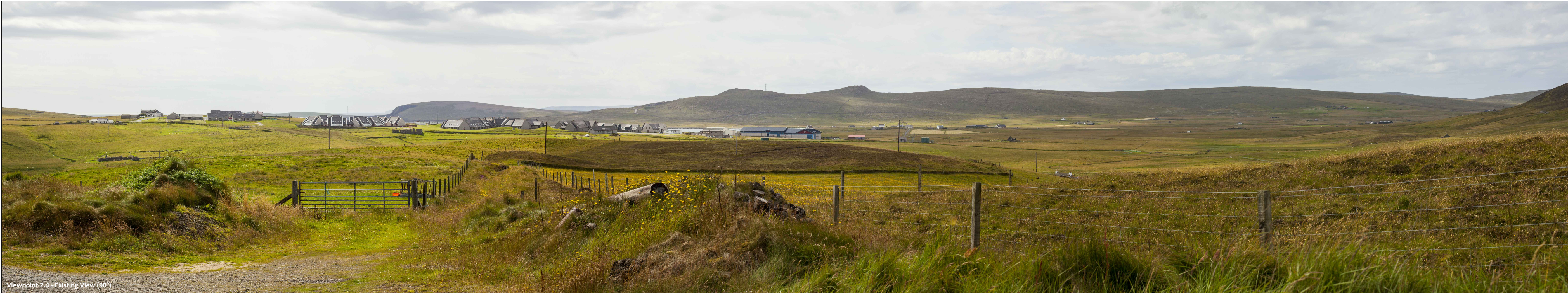
Viewpoint 2.4 - Existing View (90°)