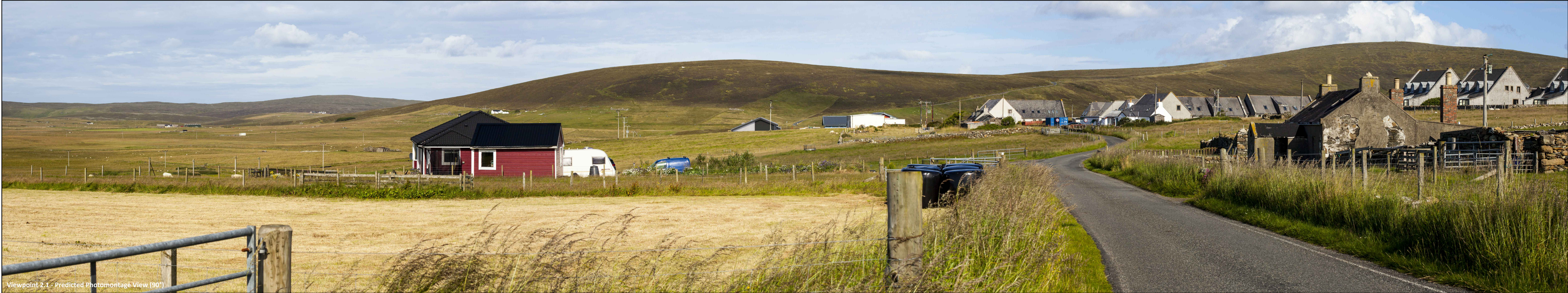
Viewpoint 2.1 - Predicted Photomontage View (90°)

Viewpoint 2.1 Information: Minor road at Valsgarth Grid Reference: 464434, 1213089 Bearing to Site: 305° Distance to Site: 400m Camera Make: Canon EOS 5D Mk II Camera Lens: 50mm Date: 27/07/2020 Time: 10:01