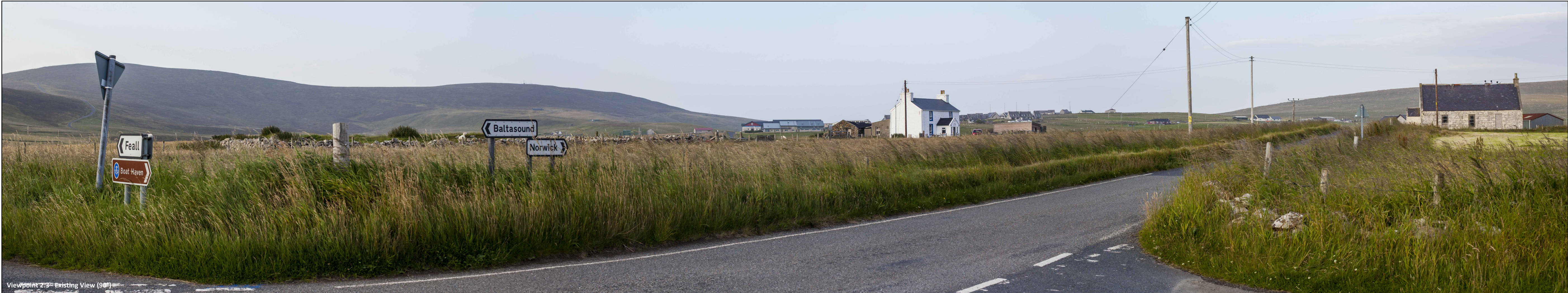
Viewpoint 2.3 - Existing View (90°)