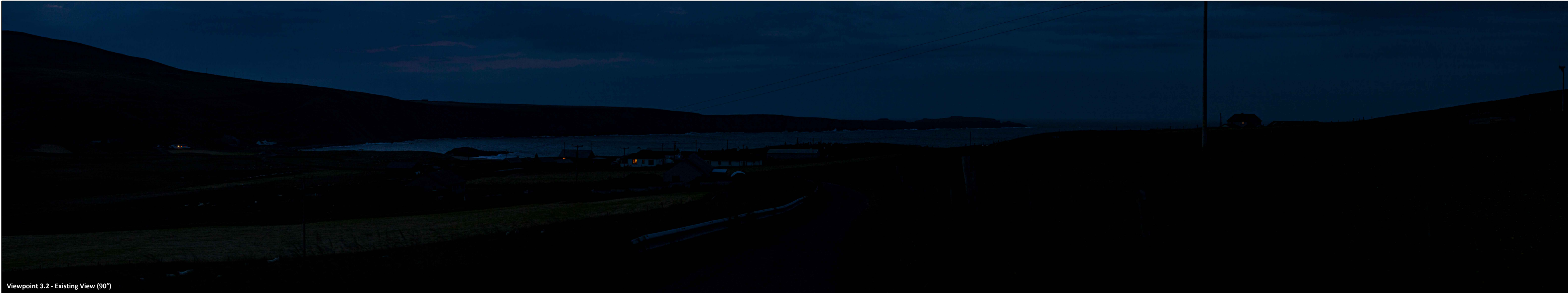
Viewpoint 3.2 - Existing View (90°)