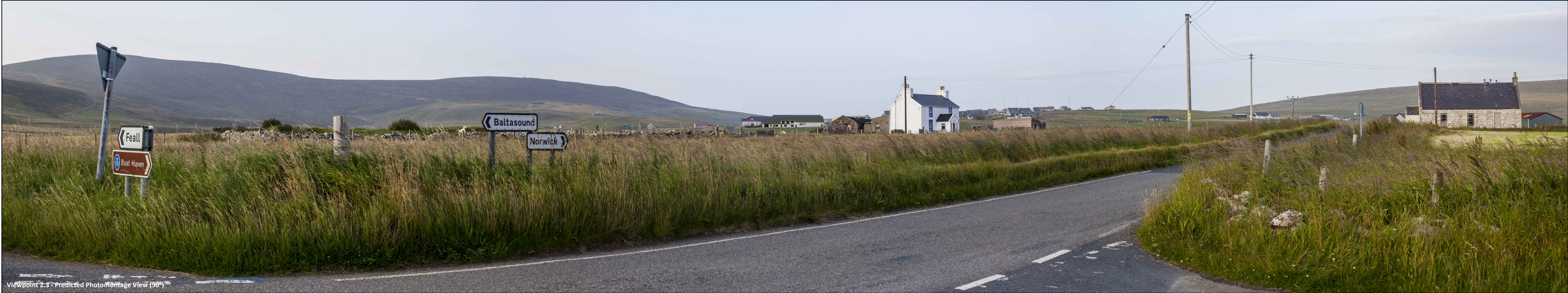
Viewpoint 2.3 - Predicted Photomontage View (90°)

Viewpoint 2.3 Information: B9087 adjacent to Unst Heritage Centre, Haroldswick Grid Reference: 463558, 1212621 Bearing to Site: 35° Distance to Site: 850m Camera Make: Canon EOS 5D Mk II Camera Lens: 50mm Date: 31/07/2020 Time: 19:54