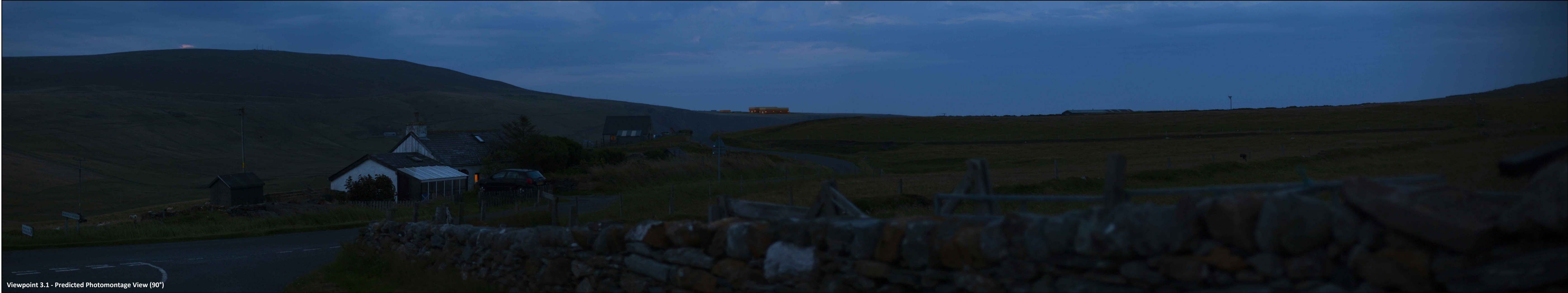
Viewpoint 3.1 - Predicted Photomontage View (90°)

Viewpoint 3.1 Information: Skulhus - Dusk Grid Reference: 464664, 1213453 Bearing to Site: 25° Distance to Site: 2.0km Camera Make: Canon EOS 5D Mk II Camera Lens: 50mm Date: 03/08/2020 Time: 23:10