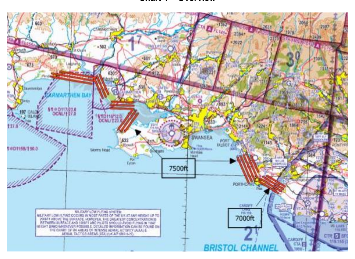
Chart 1 - Overview

30. Charts highlighting the area of operation are shown below. These are for illustrative purposes only and not for operational planning. Runs shown do not include procedural ~5nmi turn to position for each survey leg.