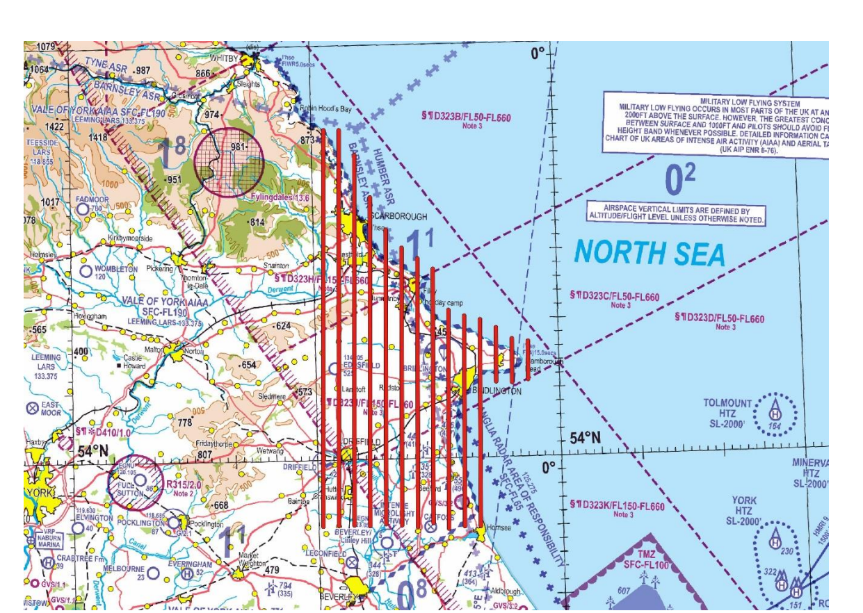
Chart 2 – 50K Grid Option Matched Orientation