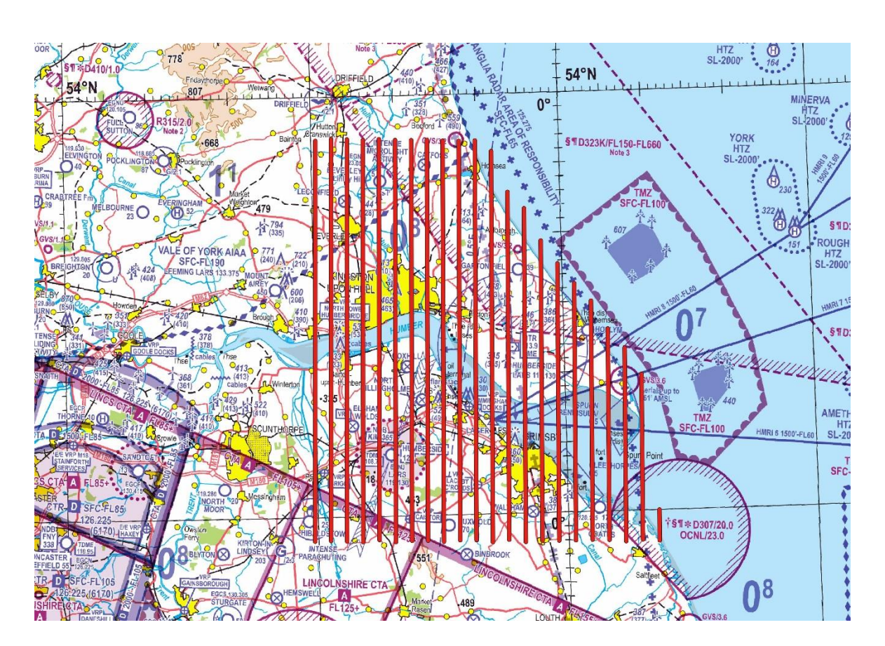
Chart 3 - 50K Grid Option Matched Orientation