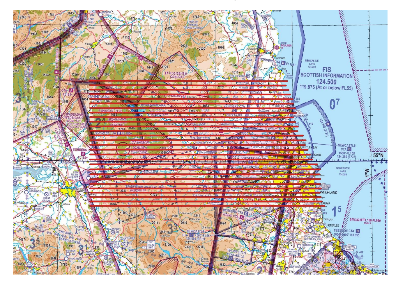
Chart 1 – 100K Grid Option

30. Charts highlighting the area of operation are shown below. These are for illustrative purposes only and not for operational planning. Runs shown do not include procedural ~5nmi turn to position for each survey leg.