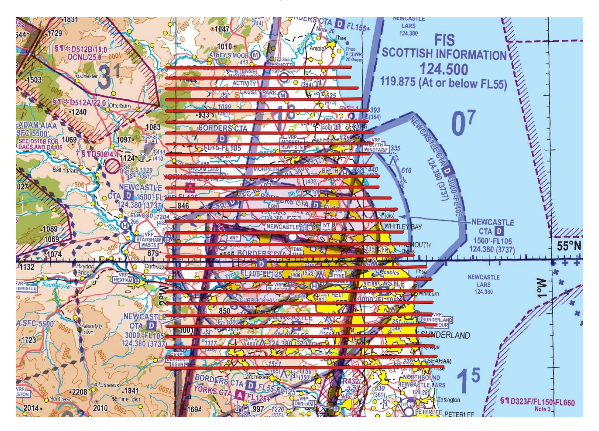
Chart 3 - 50K Grid Option Matched Orientation