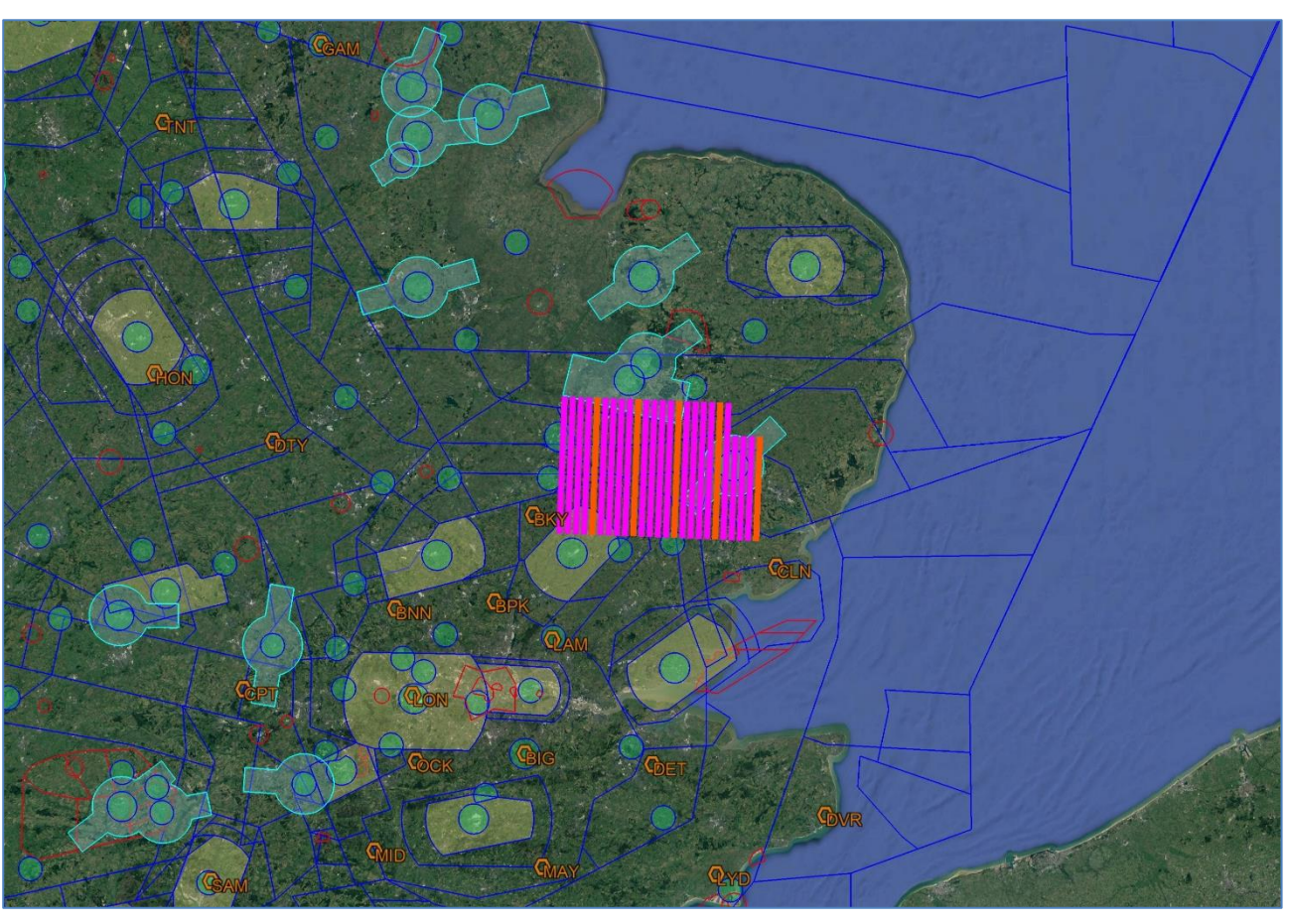
Chart 1 - Overview

25. Charts highlighting the area of operation are shown below. These are for illustrative purposes only, not for operational planning and do not show a potential teardrop procedural turn at the end of each leg. Leg 01 is the most westerly and for ease of identification, each 5<sup>th</sup> leg is shown in orange.