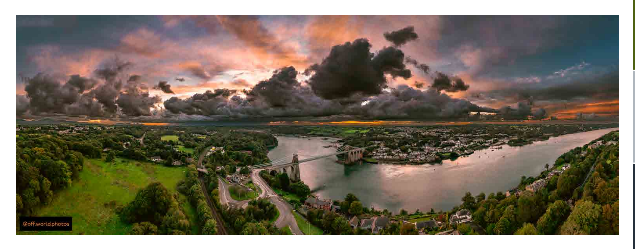
NATS staff vote 'Autumn thunder rolling in' by Matt Hoyland

"My image was taken just above the Gwynedd shore facing southwest looking towards the Menai Bridge and the Menai straight. It was late last September, just as the sun's going down, on a day when we had thunderstorms coming in the evening and the thunder clouds are on the horizon. There's rain falling in the far distance and the light is behind the clouds. So it's all purple and blue, behind the clouds and yellow and I couldn't have timed it better really. My drone is a DJI Mavic 2 Pro and this was photographed at approximately 290 feet in the air above a field looking south west.