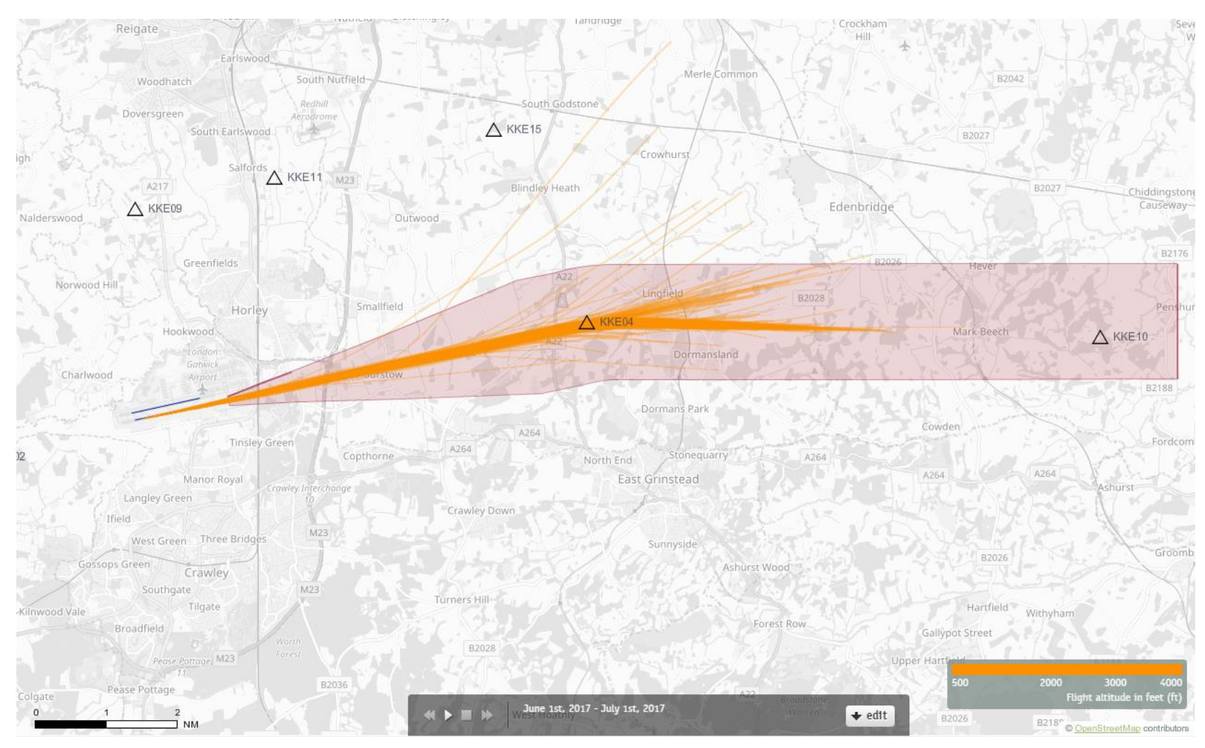
Orange plots show the tracks of aircraft until at an altitude of 4000ft