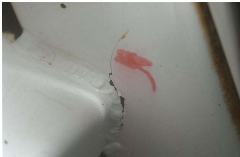
Figure 2. An example of a crack emanating from a welded connection.

Further Information can be obtained from: